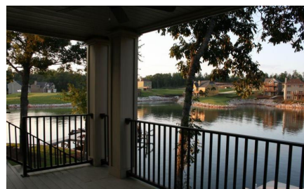
View from upper level covered deck