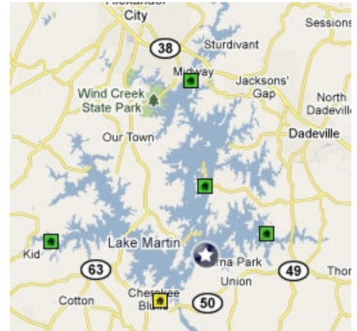
White Star = 40 Cottage Loop