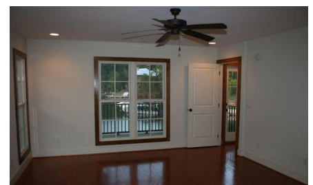
All bedrooms have hardwood floors

Take a VIDEO TOUR of this home: LakeMartinVoice.com/40-cottage-loop