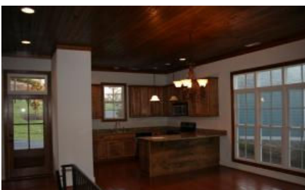
Kitchen and front door